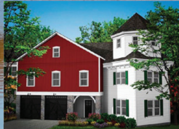
500 Main Street #5

6BR | 6/3 bath | 9,751 sq.ft. | 2.76 acres List Price $3,300,000