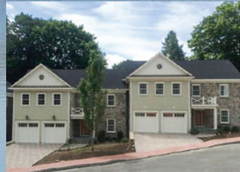
500 Main Street #11 & #15

3BR | 3/1 bath | 3,800 sq.ft. | condo List Price $1,990,000