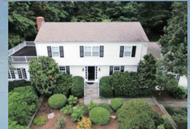
33 Indian Cave Road

3BR | 3/1 bath | 2,890 sq.ft. | condo List Price $1,300,000