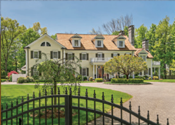
174 Branchville Road

Properties Under Contract With Karla Murtaugh Homes In Q1 2017 Alone*