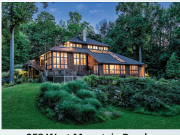
258 West Mountain Road 5BR | 5/1 bath | 6,504 sq.ft. | 3.02 acres Sold 01/2017 | $1,232,500