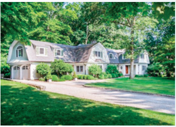
99 Hickok Road 4BR | 3/2 bath | 5,252 sq.ft. | 2.31 acres Sold 01/2017 | $1,550,000 (New Canaan)