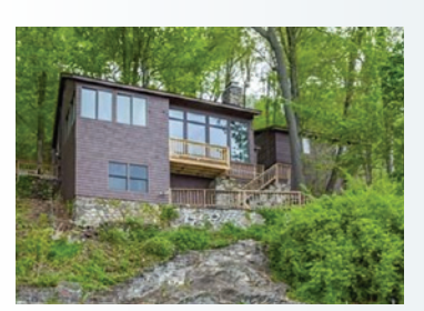
33 Deer Run 2BR | 1 bath | 832 sq.ft. | 0.49 acres Sold 02/2017 | $617,500 (New Fairfield)