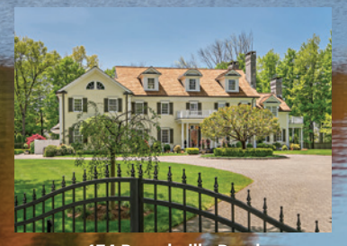
174 Branchville Road 6BR | 6/3 bath | 9,751 sq.ft. | 2.76 acres List Price $3,300,000