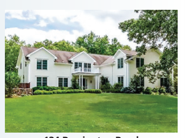
134 Remington Road 5BR | 5/1 bath | 4,419 sq.ft. | 1.16 acres Sold 02/2017 | $950,000