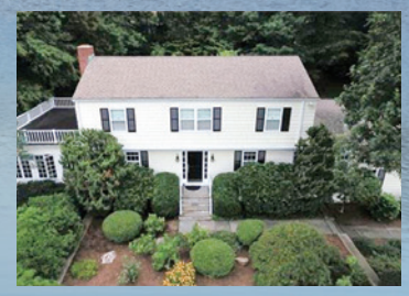
33 Indian Cave Road BR | 2/1 bath | 2,578 sq.ft. | 1.02 acre List Price $725,000